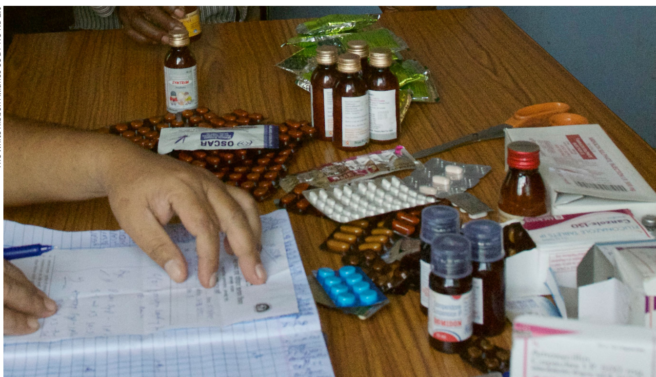
Health centre in India (not associated with the research).

This report was supported in part through a grant from the Open Society Foundations.